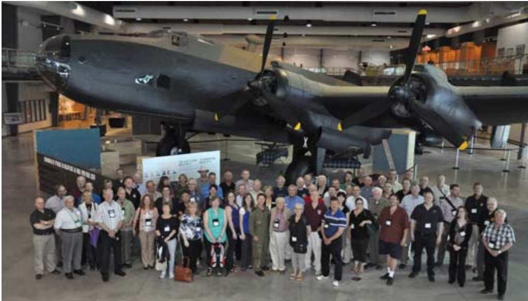
Group at National Air Force Museum of Canada