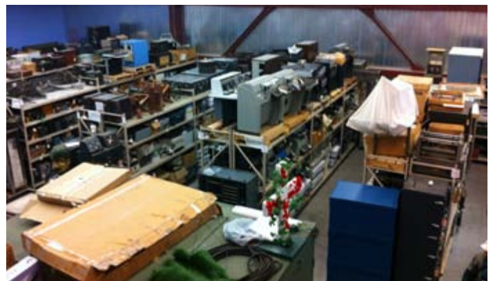
View of the MC&E Museum's storage facility from the mezzanine