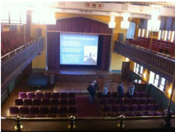
Currie Hall at RMC