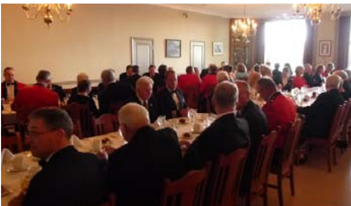
Members at the RMCC Senior Staff Mess for the formal dinner