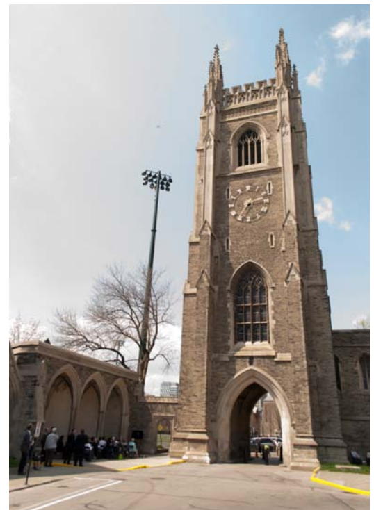
Soldiers' Tower war memorial