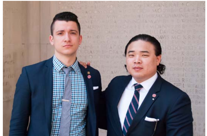
Members of Zeta Psi Fraternity in front of the Memorial Wall