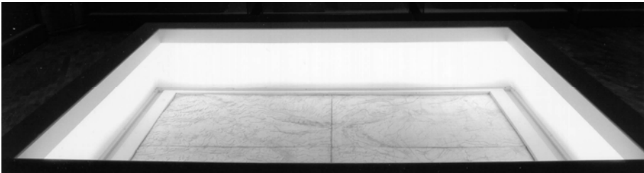
3D Map of Vimy