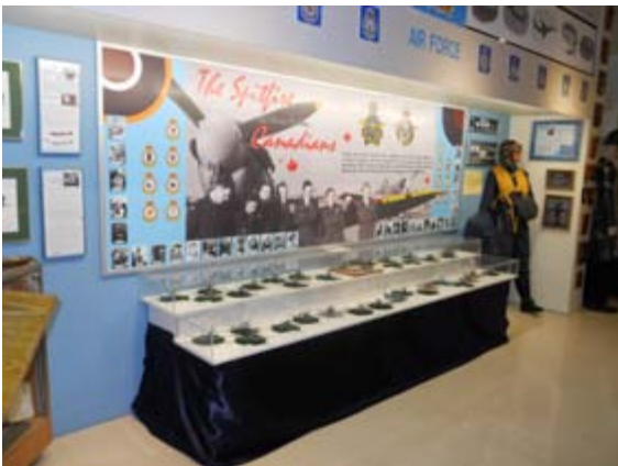
A shot of the display "Spitfire: As Flown by the Canadians"

For those fortunate enough to have seen a Spitfire in flight, chances are they would never forget the experience; the sight of this majestic fighter in the air is only surpassed by the sound of the Rolls Royce Merlin engine that powers it.